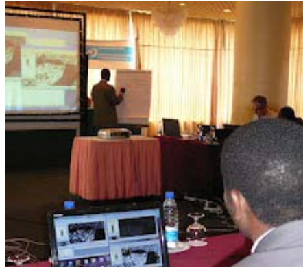
ILWIS training session

From 7 to 11 May 2012, UN-SPIDER supported a follow-up training in remote sensing for disaster management upon request of the UN-SPIDER National Focal Point for Cameroon. The training was conducted jointly with the United Nations University Institute for Environment