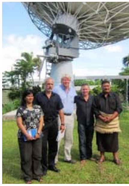
The mission team in Tonga

UN-SPIDER staff was joined by experts from the Secretariat of the Pacific Community (SOPAC), the United Nations Office for the Coordination of Humanitarian Affairs (UNOCHA), the Geographic Information System (GIS) Division of the Ministry of Lands, Survey and Natural Resources, academia and a leading regional crowdsourcing expert. The mission built