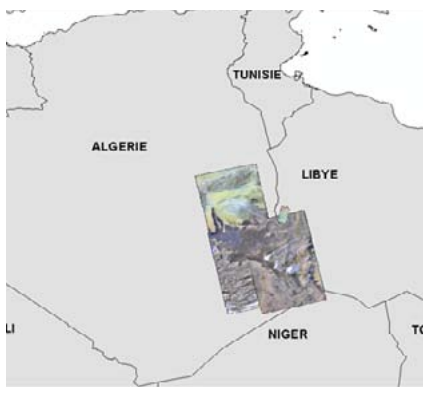
Situation maps derived from satellite imagery

Kamel Tichouiti: In January 2012 the locust activity in the Wilaya d'Illizi region in Algeria had significantly increased with several swarms coming from biotopes in South-West Libya and South-East Algeria. Consequently, the Algerian RSO and ASAL jointly supported the National Institute for the Protection of the Vegetation (INPV) by creating a map indicating the risk zones for the region, analyzing the ecological conditions of the migratory locust for the period January to April 2012. We did this by interpreting medium resolution satellite imagery that was made accessible to us by the Disaster Monitoring Constellation UK-DMC-2 and the Regional Center for Mapping of Resources for Development (RCMRD), which facilitated the tasking of the US-satellite EO-1.